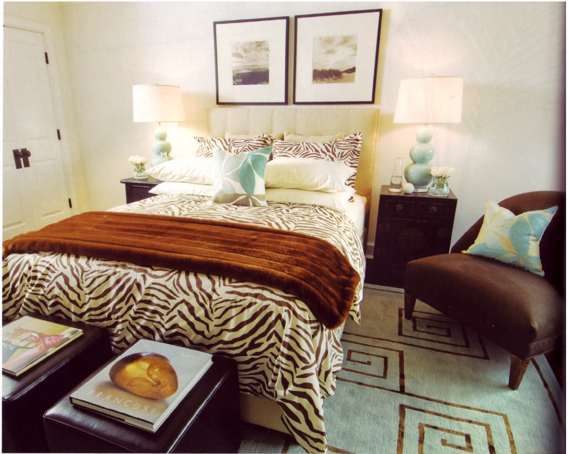
Bedroom by KHE Design. Objects d'art, Bravura.